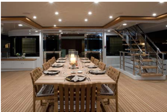
Upper deck dining