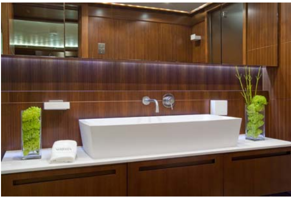
Double cabin - bathroom