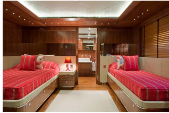
Twin cabin 2