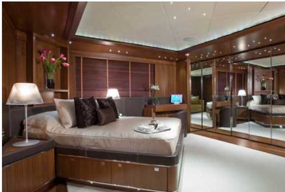
Double cabin 2