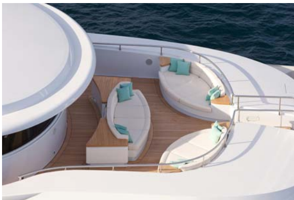
Overview - seating area