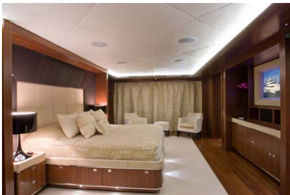
Master stateroom 2