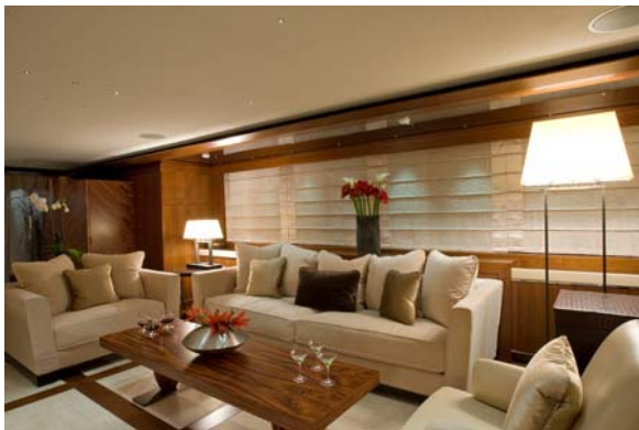
Main saloon 2