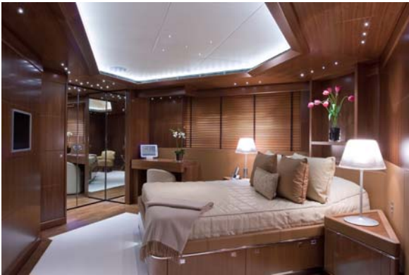
Double cabin 1