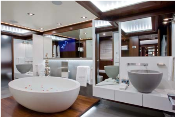
Owner's stateroom - bathroom