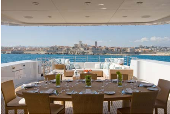
Sundeck dining 2