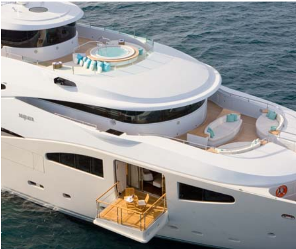
Overview - Owner's balcony