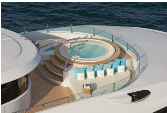
Overview - Jacuzzi