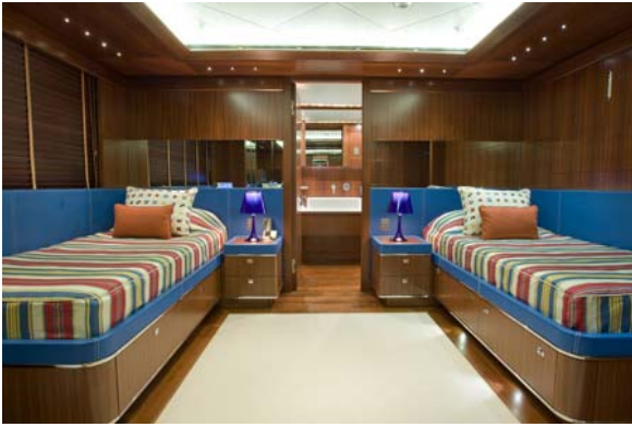
Twin cabin 1