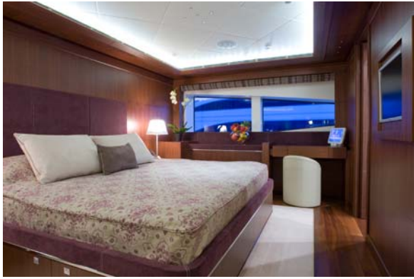
VIP cabin - upper deck