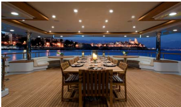
Upper deck dining 2