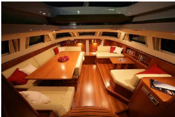
Salon View From Cockpit