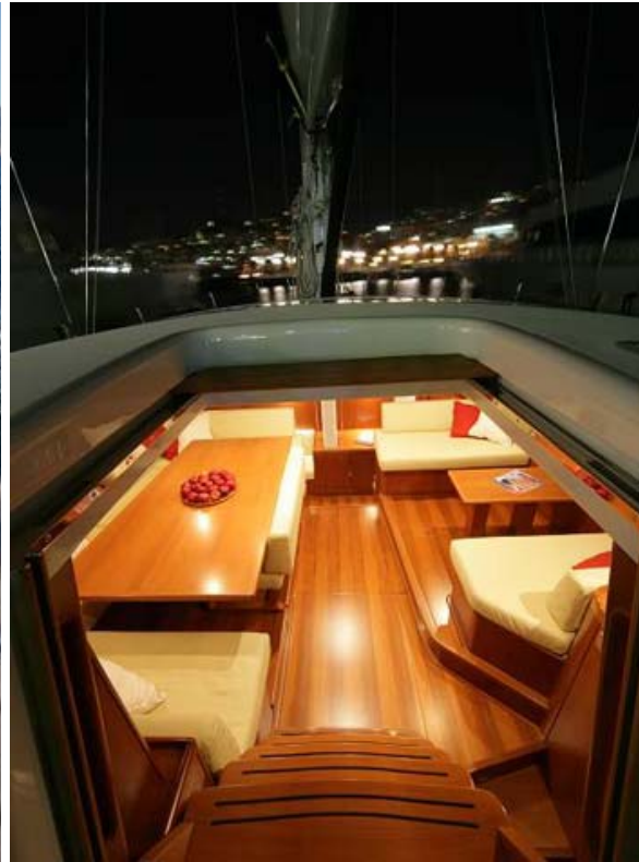
Salon View From Cockpit 2