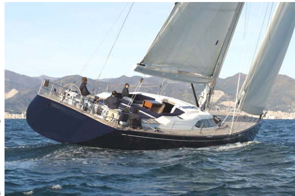
Under Full Sail