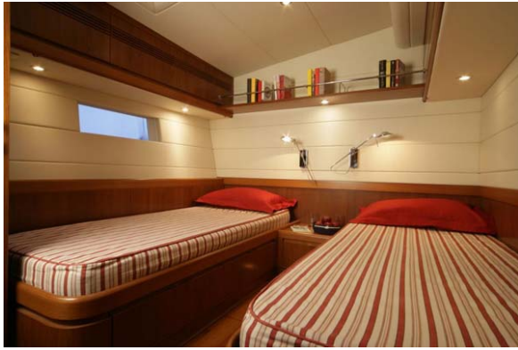
Identical Twin Stateroom