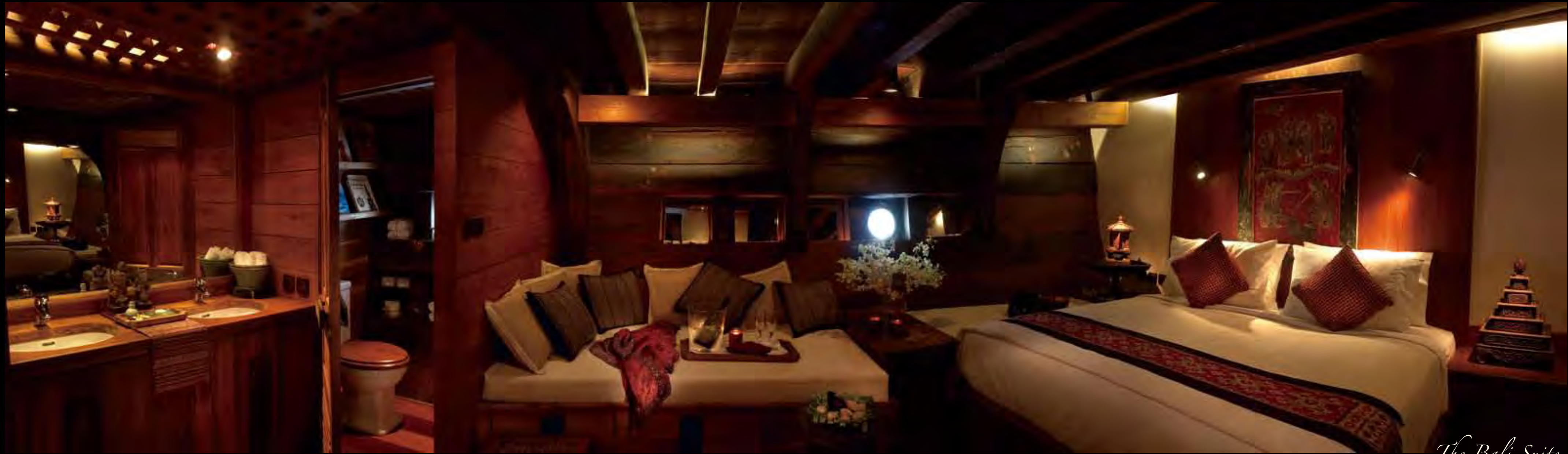
The Bali Suite