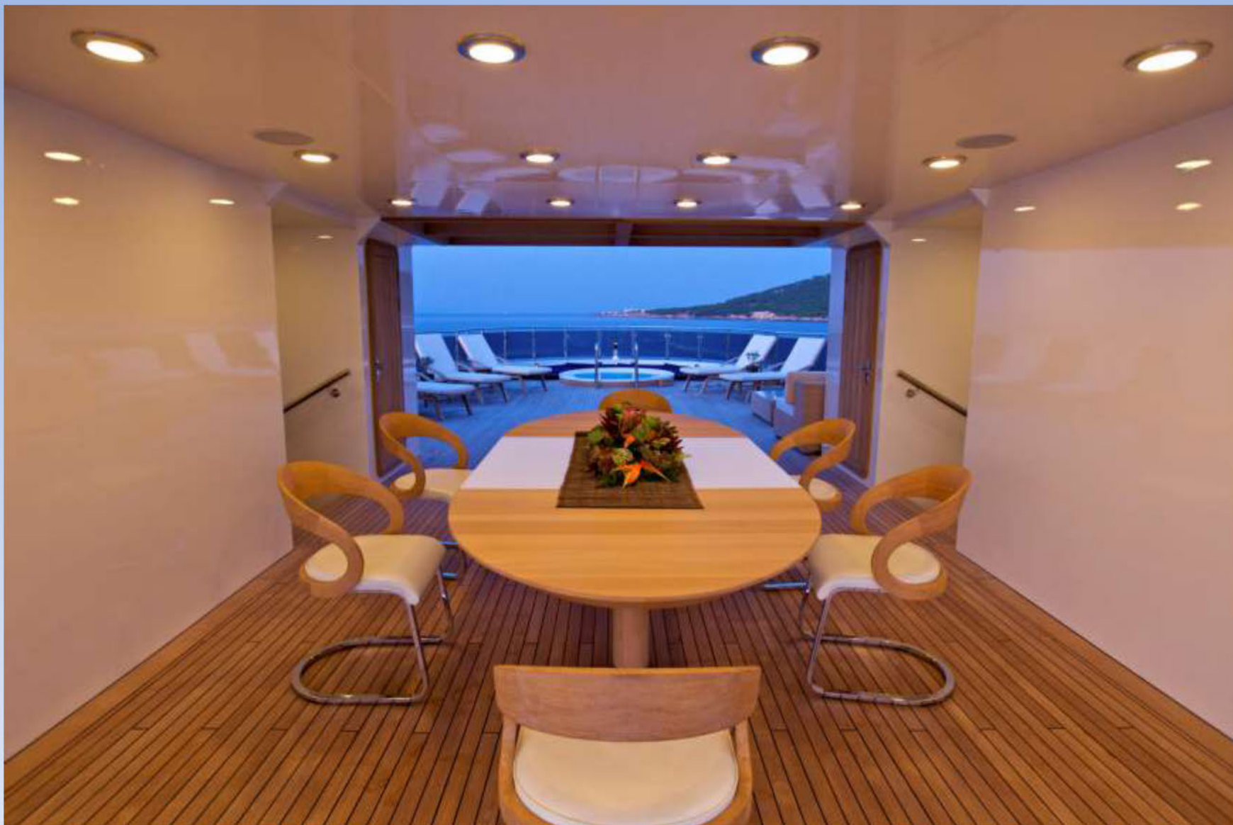
Sun Deck - Dinning