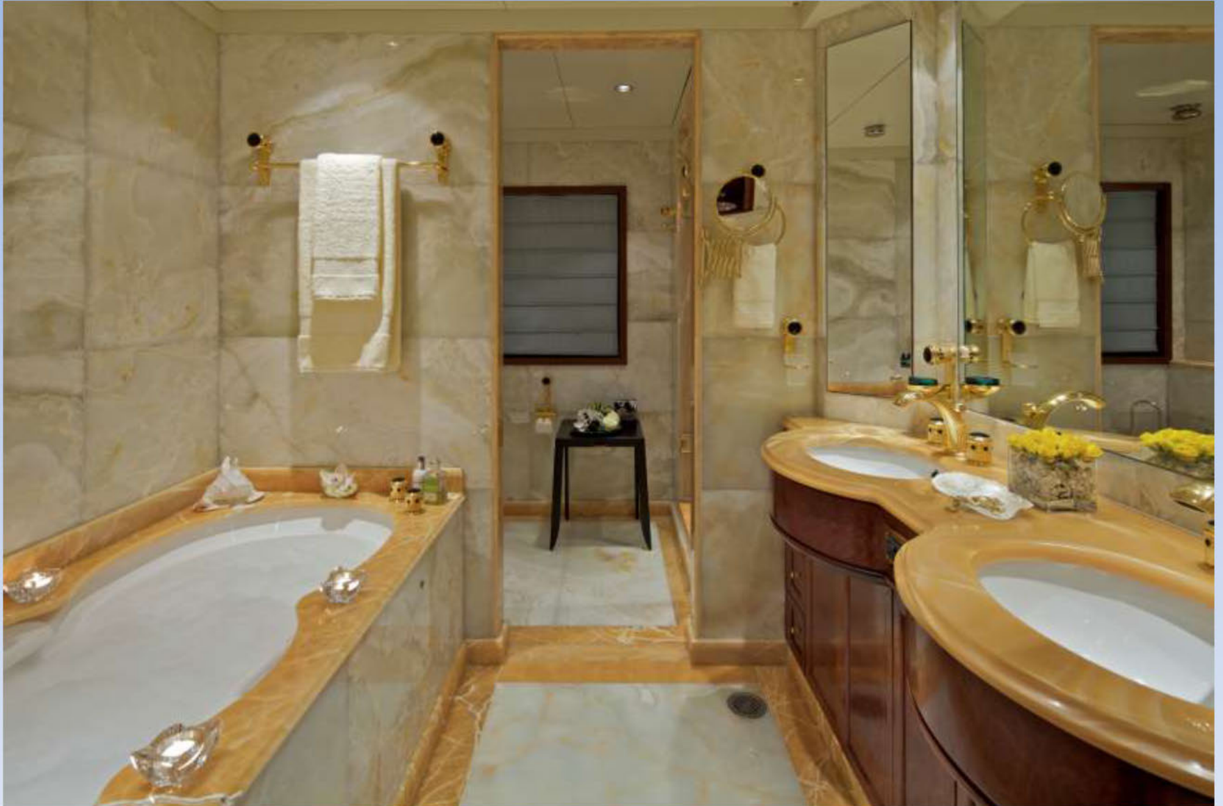
Master Suite Bathroom