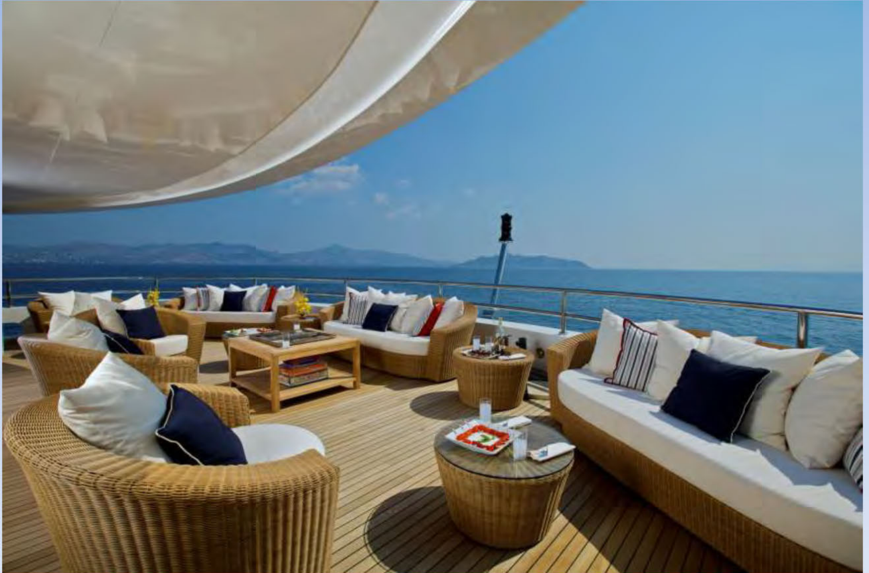
Upper Deck - Lounge