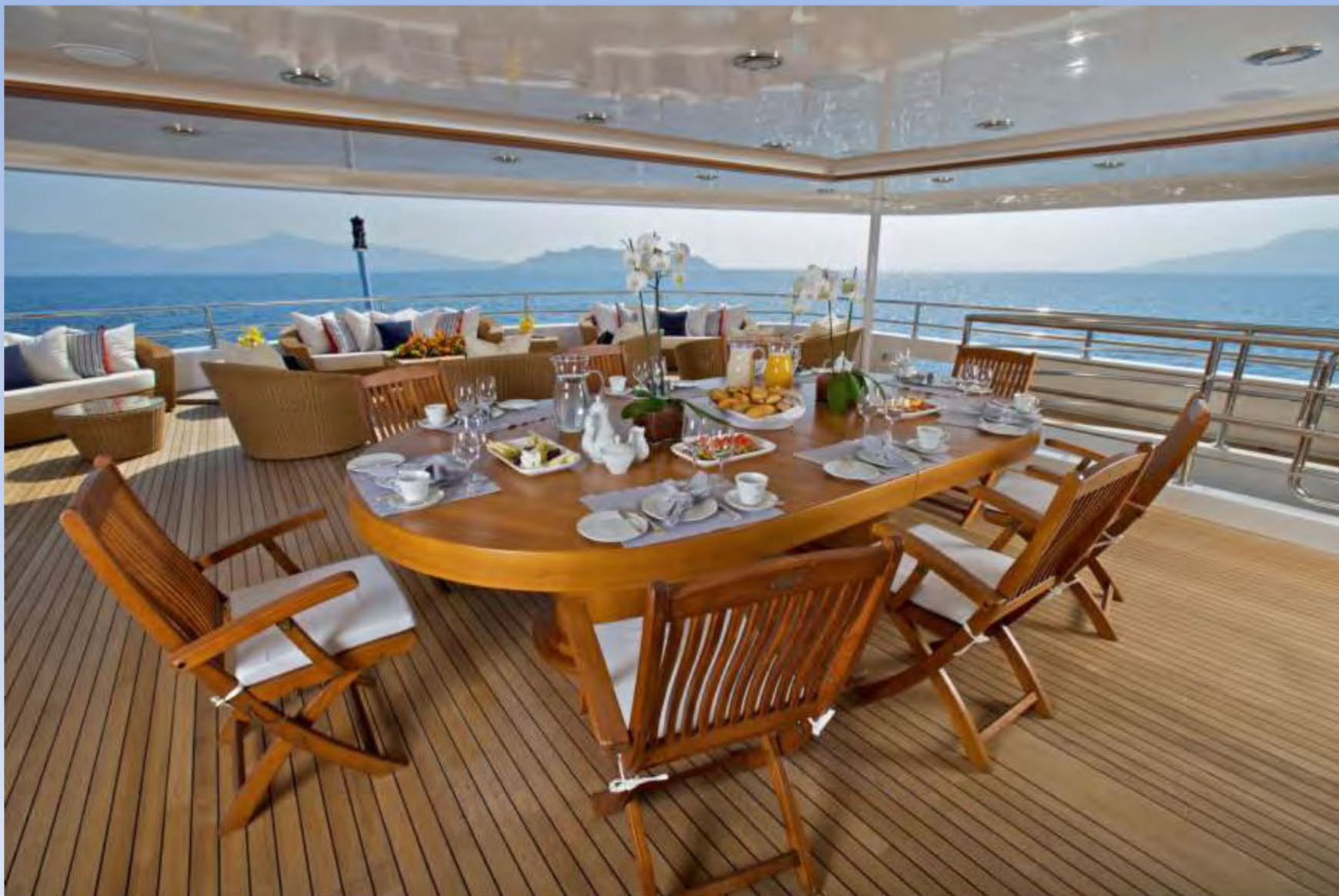
Upper Deck - Dining