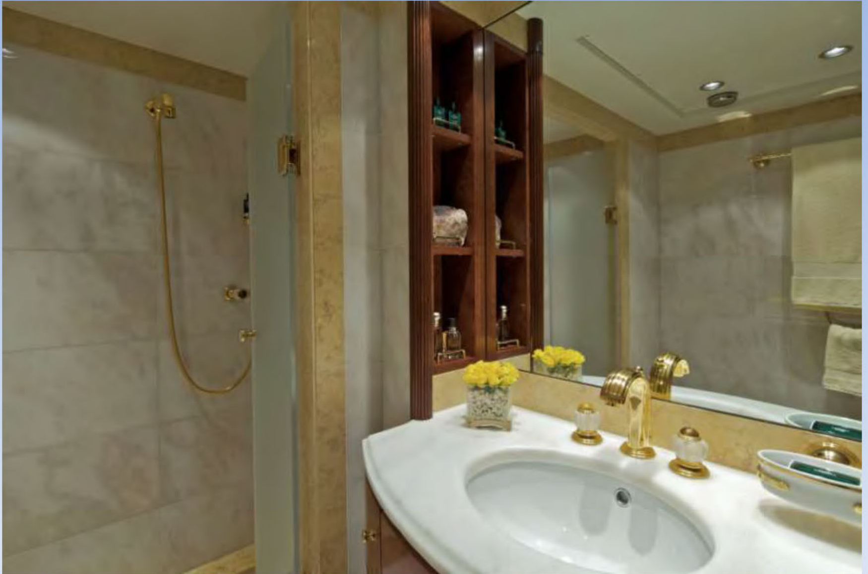
VIP Suite Bathroom