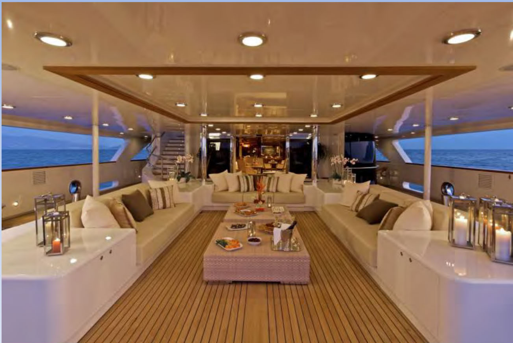
Main Deck - Lounge