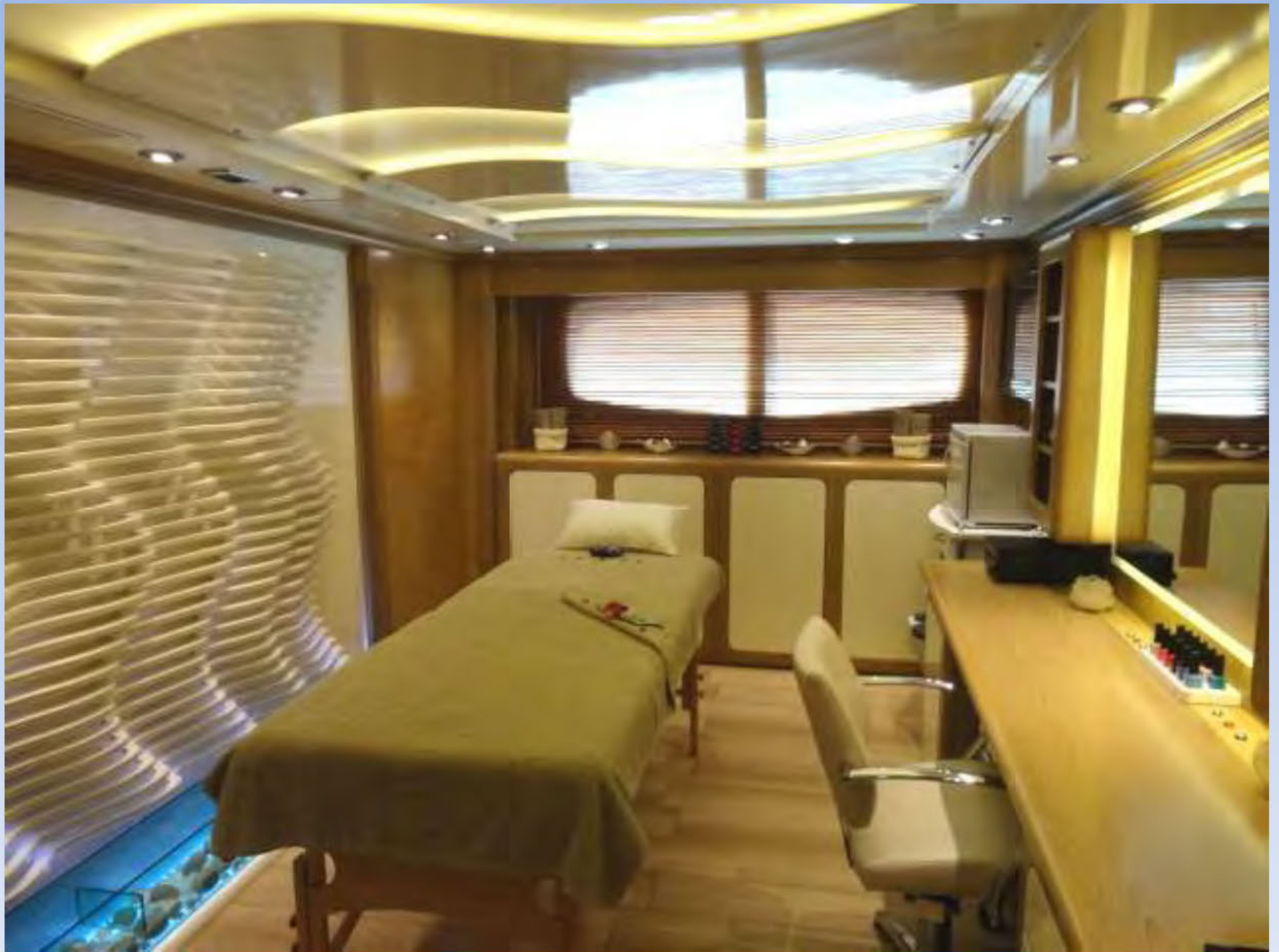
Massage Room / Beauty Salon