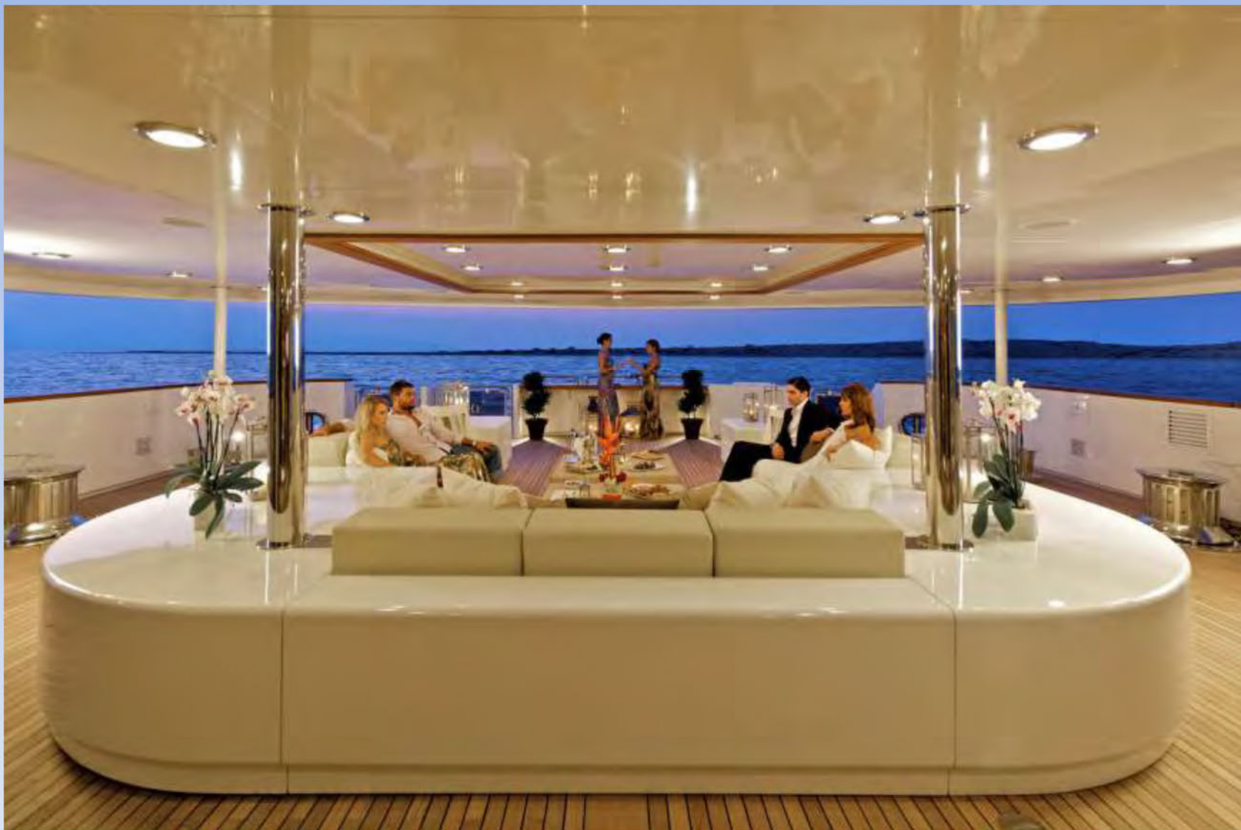
Main Deck - Lounge