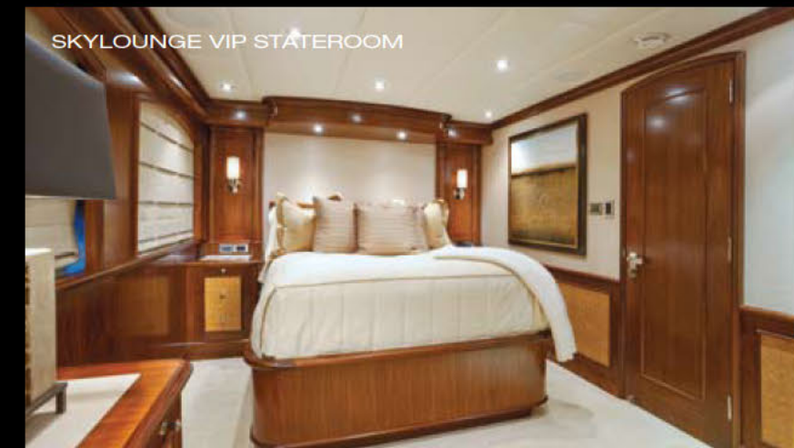
SKYLounge VIP STATEROOM