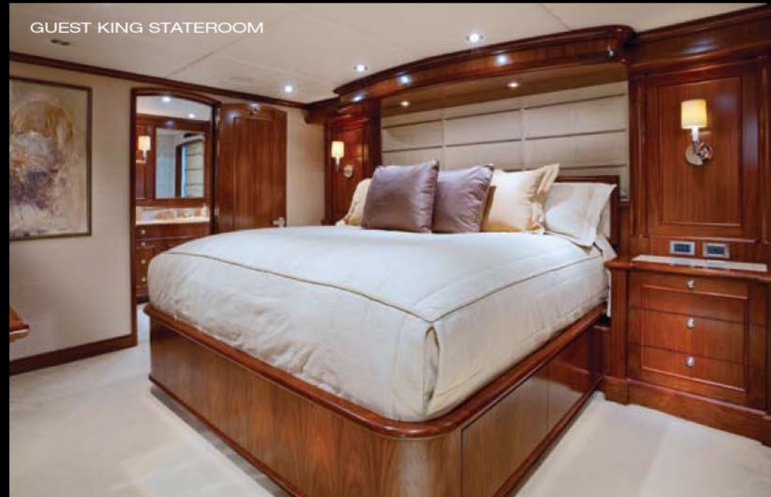
GUEST KING STATEROOM