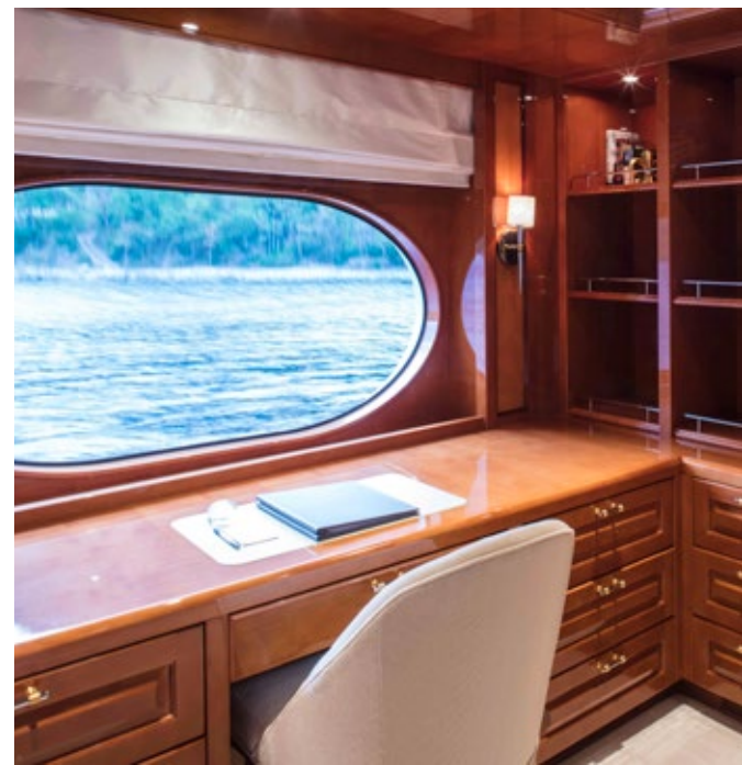
Master Stateroom & Office