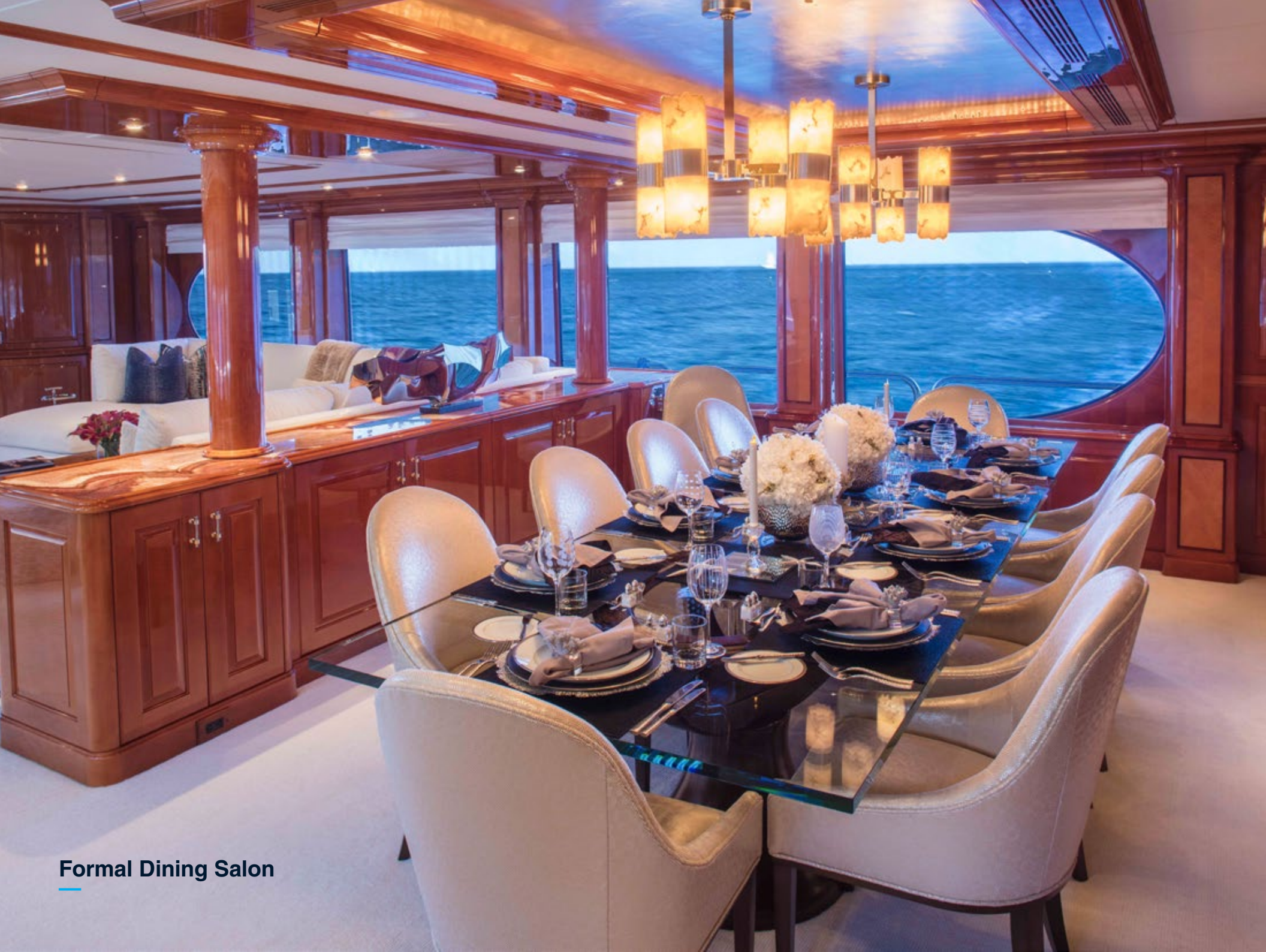
Formal Dining Salon