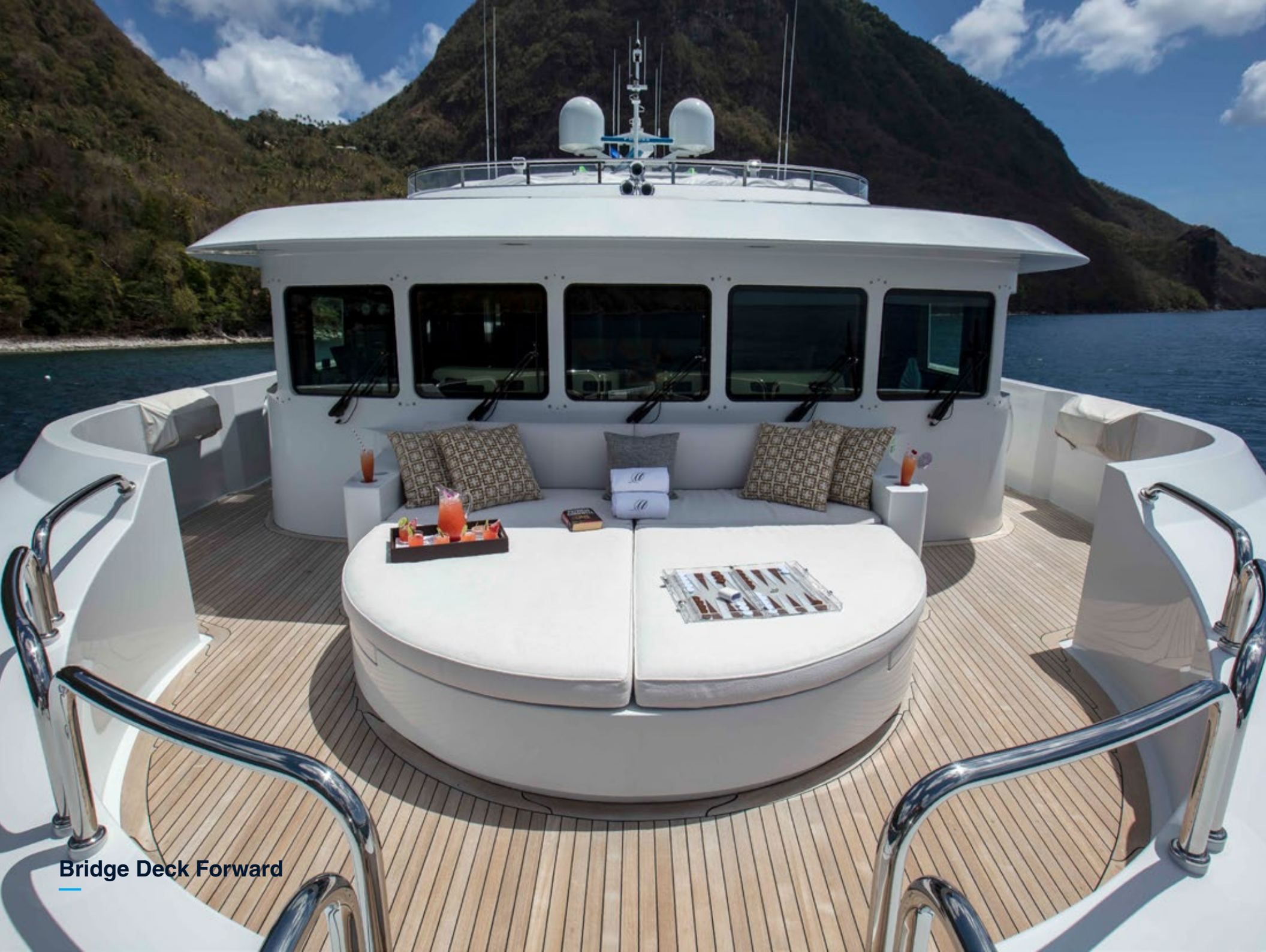
Bridge Deck Forward